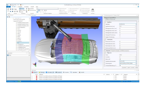
Path generation EcoPaintJet Pro

Subject to change. The information in this brochure solely contains general descriptions and performance features, which may vary in specific cases of application. The desired performance features are only binding if they have been agreed upon explicitly at the conclusion of the contract. © Dürr 2019