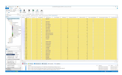
Basic package – Parameterization Color assignment